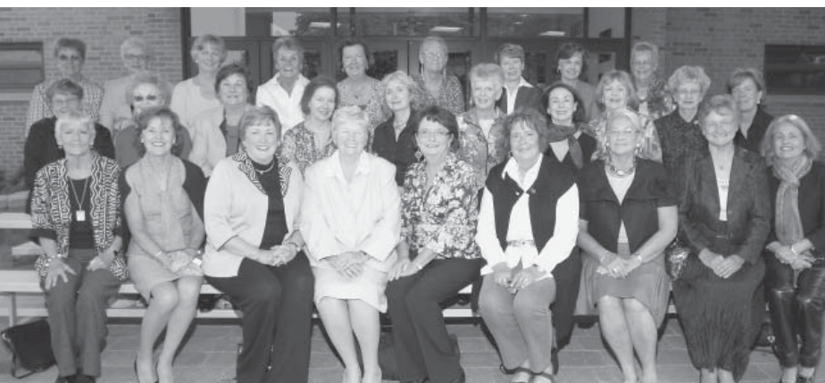
Members of the Class of 1959 gathered at McAuley on Mercy Day for their 50 year reunion celebration. The classmates enjoyed a performance by the current McAuley students, a luncheon and tour of the school.